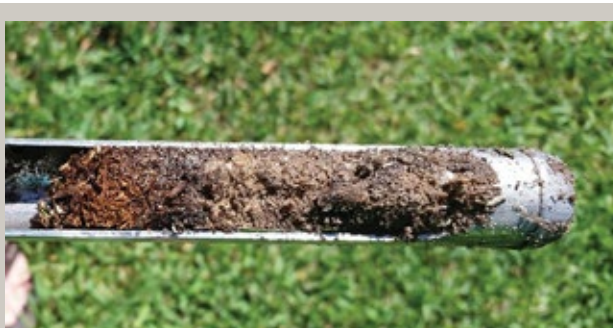
A soil test provides the means of monitoring the soil so deficiencies, excesses, and imbalances can be avoided.

High soil compaction negatively impacts plant establishment, growth, and quality in newly constructed communities. A thorough understanding of these urban soil characteristics is necessary to develop appropriate landscape management plans that maximize plant growth and establishment, while minimizing water use and nutrient runoff. Urban soils are diverse, complex, and affected by numerous human and environmental factors. Urban activities that disturb the soil, such as foot and vehicle traffic, as well as building and roadway construction, result in an increase in bulk density and compaction. As a result, water cannot infiltrate into compacted soil efficiently. After heavy rain, standing water may appear or may run off into surrounding low-lying areas as a result of compacted soil, which can bring on drainage problems.